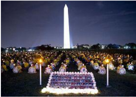
Falun Gong practitioners from around the world gathered at the Washington Monument in Washington DC on July 22, 2010, to mourn practitioners in China who have lost their lives in the persecution of Falun Gong.

(Clearwisdom.net) On the evening of July 22, 2010, more than a thousand Falun Gong practitioners from around the world participated in a candlelight vigil in front of the Washington Monument to commemorate practitioners in mainland China who have died as a result of the persecution.